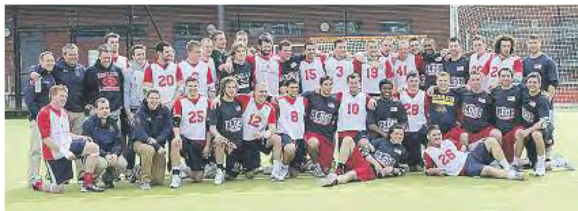
The English National team